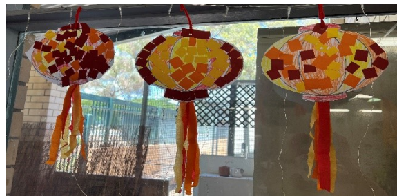
Happy Chinese New Year