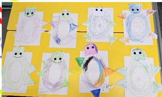
Practising our Numbers