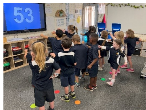
Counting to 100 'Let's Get Fit'