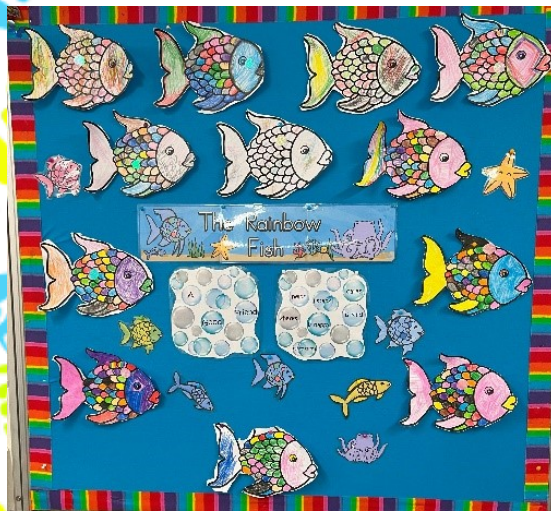
How To Be A Good Friend