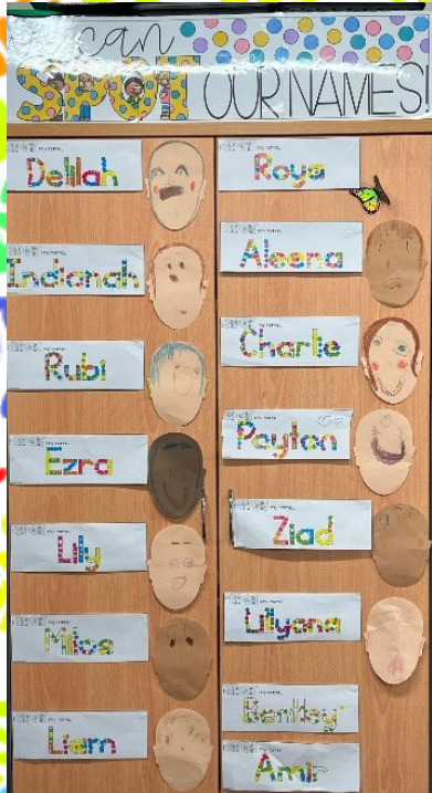
Practising our names