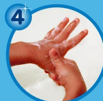
Base of thumbs