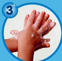
Back of hands