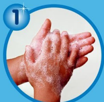
Palm to palm

With clean towels We dry our hands Now let's show our friends!