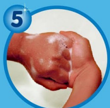
Back of fingers