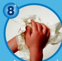
Rinse and wipe dry